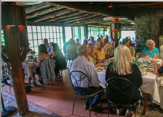
Jennerstown Lunch, Theater — June 24