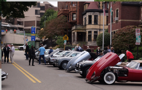
Pittsburgh Concours — Sept. 29