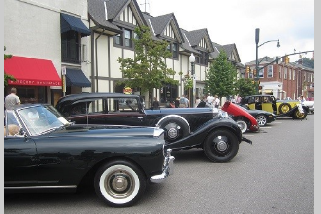
The Sewickley Show — August 11