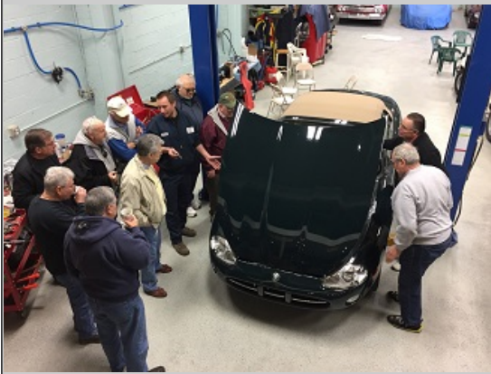
Spring Tech Session — April 28