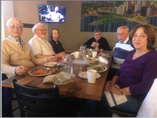
Spoonwood Brewing Co — March 22