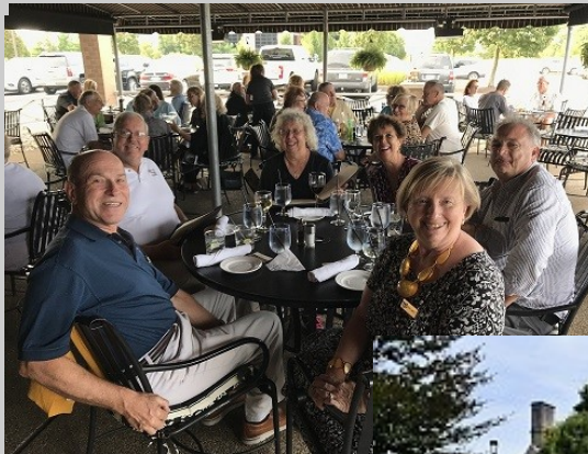
Jaguars at Jacksons — August 25