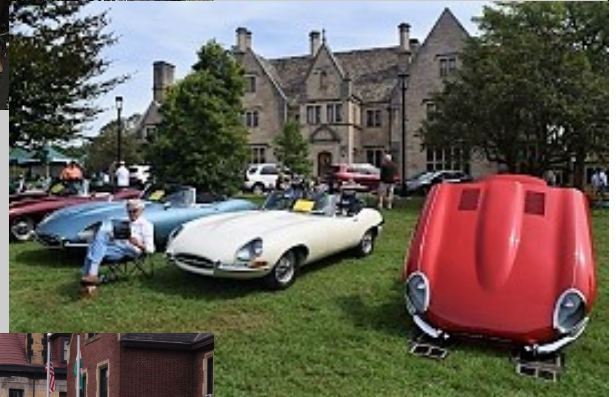
Hartwood — Sept. 23