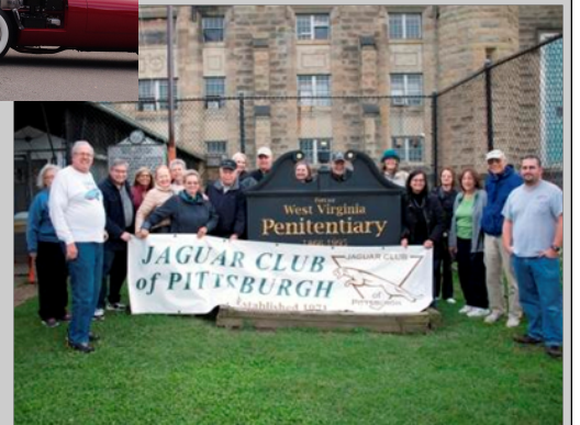
Fall Leaf Tour — October 20