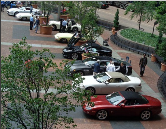
US Steel Plaza Display — June 5