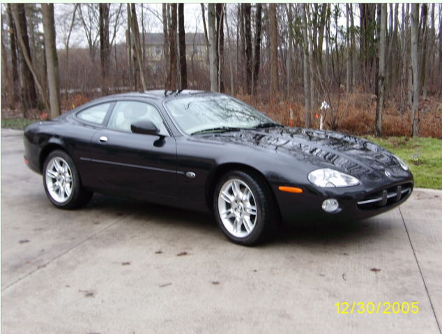
Above: His 2001 XK8