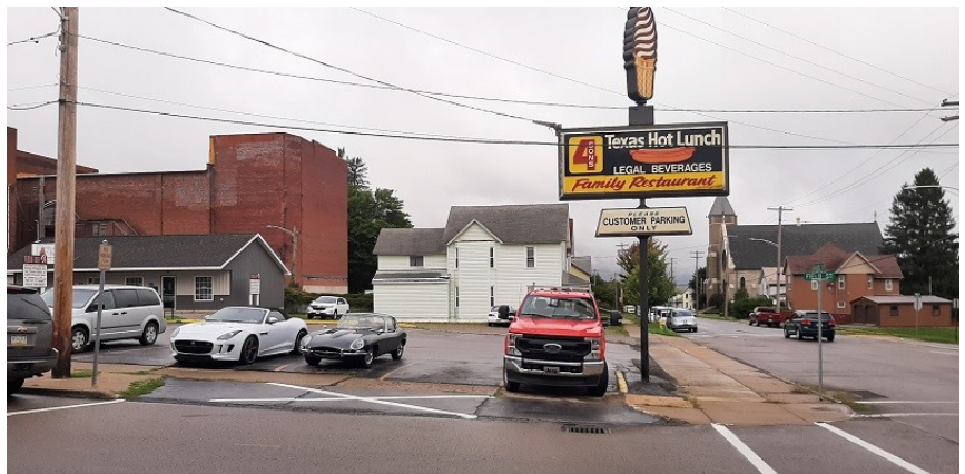
Traditional Wednesday lunch stop in Kane, PA

Our route uses two-lane primary roads for the most part, staying away from interstates and other four-lane roads when possible. On average we'll cover approximately 800 miles for the weekend, and to this point everyone's car has returned home under its own power. There of course have been some minor breakdowns over the years, but nothing out of the ordinary for cars of that era. Our most recent trip served to remind us of some very basic issues that can happen.