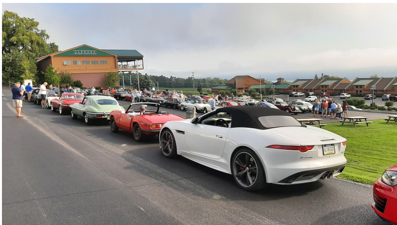
Staging for the Glenora Run Friday morning

Friday is the day of the Vintage Grand Prix Festival in downtown Watkins Glen. There are a variety of associated events, from tours to concours. We had chosen to participate in the Glenora Run, sponsored by the Glenora Winery. At the start directions are handed out, taking you on the back roads of the area. On one of those back roads, our car suddenly stopped from fuel starvation. I have had fuel pump issues over the past several years, so I immediately suspected the recently replaced pump had quit. There was no "tick tick tick" from the pump even after a few well-placed taps with a hammer.