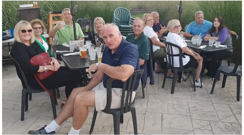
Relaxing on the Seneca Lodge deck

The Watkins Glen Vintage Grand Prix is held on the weekend following Labor Day, September 8 – 10 in 2023. For anyone with an interest in vintage cars it's definitely worthwhile to attend the event at least once. People come from New England, Canada, and the Midwest in a wide variety of classic cars to participate. We have met folks from Europe there as well. You can find information at WatkinsGlen.com . If you look closely at some of the pictures of past events on their website, you'll likely see some familiar cars. If you plan to go, it's best to make reservations a year in advance.