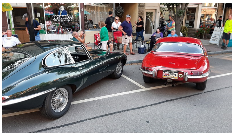
Franklin St. Watkins Glen on Friday afternoon