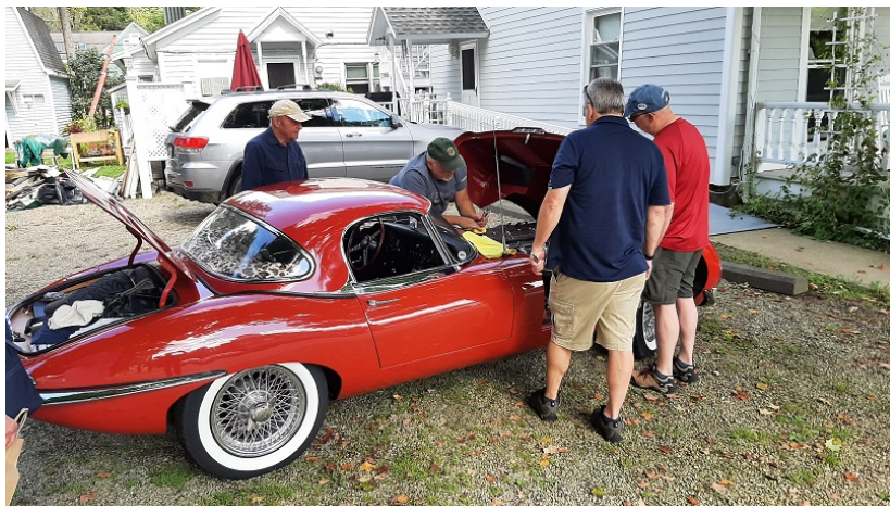
Thursday morning tech session