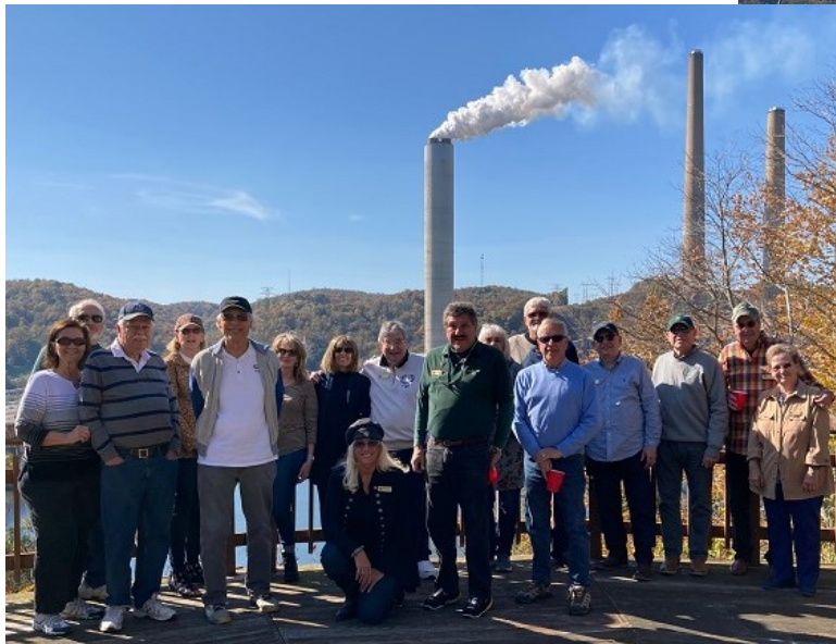
And one more group shot before heading back home.