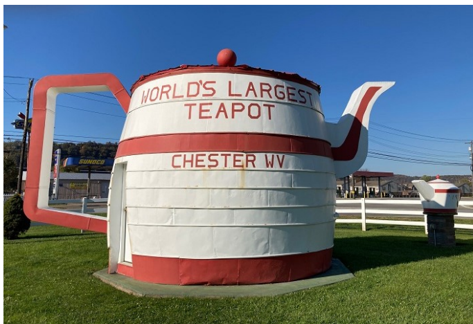
This could hold a lot of English Breakfast tea!