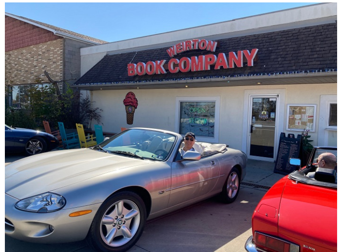
Chuck Pipich parked as close as he could to the entrance to the book, candy and ice cream shop.