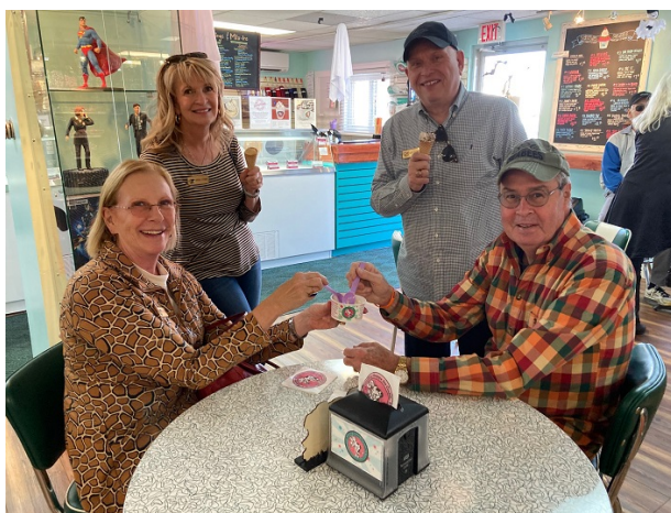
Several members of our group enjoyed some ice cream before we took to the roads again.