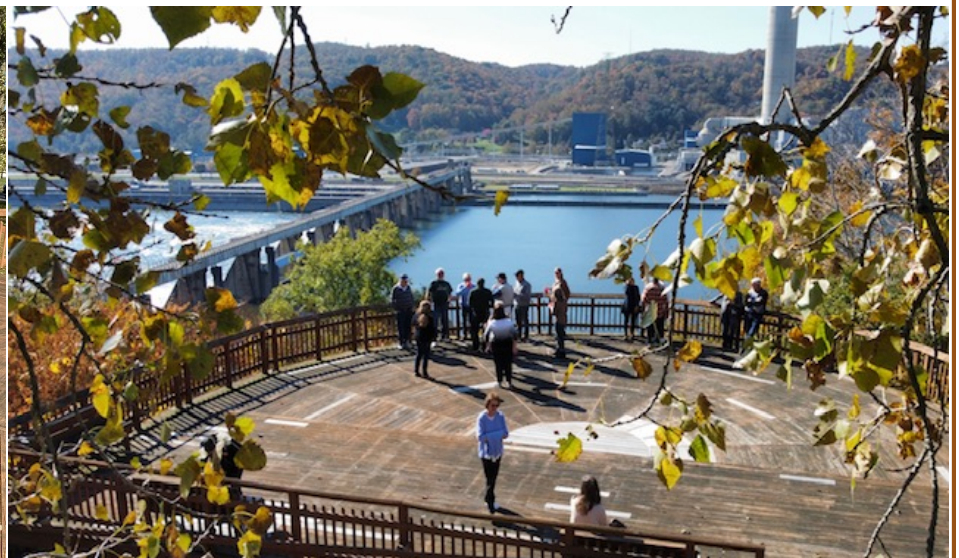
Ken Como, at left, (shown with Chuck Pipich and Dave Gamret) was capturing drone photos such as the one in the photo at right.