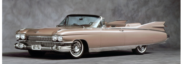
1959 Cadillac Eldorado with tailfins.

1946 The first power windows were introduced.