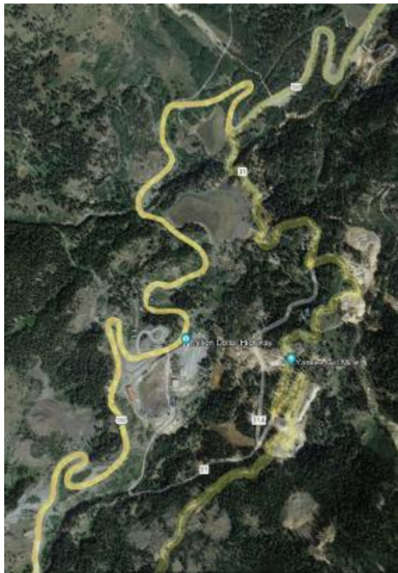
At left: Note the switchbacks on the Million Dollar Highway

The Million Dollar Highway's name comes from the alleged amount of gold ore that remained in the roadway's fill during construction. The Million Dollar Hwy took us up to Silverton (el. 9,300 feet), then we continued north to Ironton (el. 9,800 feet) some 500 feet higher in elevation. The hard part is driving a 66-year old car with drum brakes down to Ouray (el. 7,800 feet) a drop of 2,000 feet in 12 miles, through very tight switchbacks and having a very stressed navigator helping you to vicariously slow the car down. (I may have to work on the passenger floor pan due to the dent from the navigator's apparent help with slowing down the car.) Note there are no pictures of this drive as the navigator's eyes were closed most of the time!