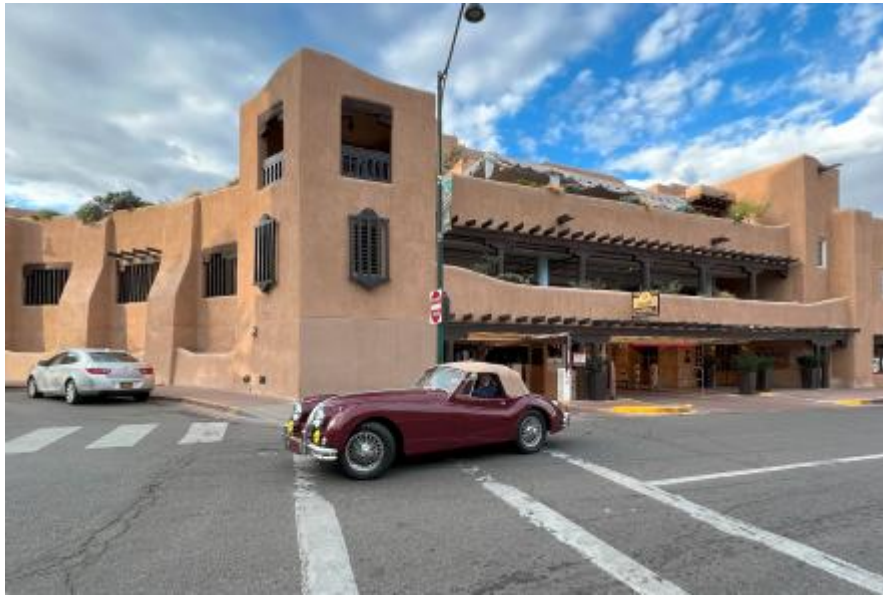
Claire in front of the rally starting and end point; La Fonda Hotel, Santa Fe, New Mexico.

The Western Passage is a 1,400 mile rally that starts in Santa Fe, New Mexico, tours northern New Mexico and southern Colorado. The rally included in New Mexico; Albuquerque, Santa Fe, Jemez Pueblo and Valle Grande Caldera; and in Colorado; Mesa Verde, Ouray, Silverton, Dalton Ranch, Telluride, and Taos Pueblo among other interesting areas of northern New Mexico and southern Colorado. Sound like fun? Try it in a 66-year old Jaguar XK140 DHC, named Claire, and to add another wrinkle, add your wife of 48 years, who is more comfortable in a car of the current decade, as your navigator.