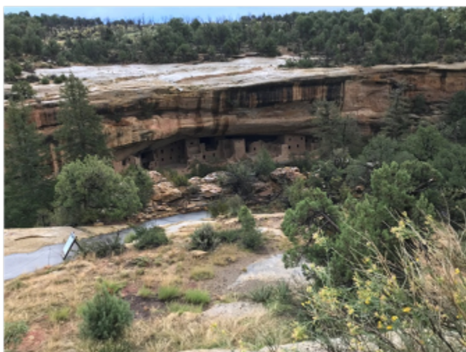
Long House, Mesa Verde National Park

Before heading back to Santa Fe, New Mexico we spent a night at Mesa Verde National Park. The park's accommodations are Spartan at the very least with no cell service, internet, or television; however, they did have alcohol so not a total loss.