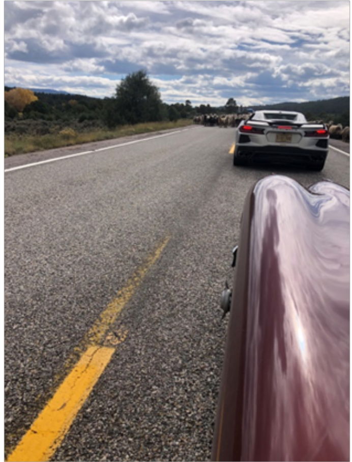
At right: Thousands of sheep being moved from one field to the next by road, Colorado

The trip back to Santa Fe was interrupted by having to wait 30 minutes for a flock of several thousand sheep to pass as they were being moved from one field several miles along the highway to another field.