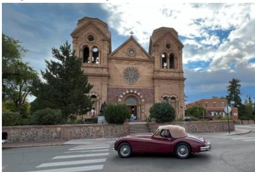
Cathedral Basilica of St. Francis of Assisi, Santa Fe, New Mexico

Claire, however, impressed me by starting up every time, even at Telluride, elevation 9,500 feet above sea level, without any problems. However, when I started the rally in Santa Fe, I noticed the speedometer was not working. This had happened before and I think it is from having a speedometer internal cable that is a little too short to seat securely into the transmission (provided with the 5-speed transmission I installed).