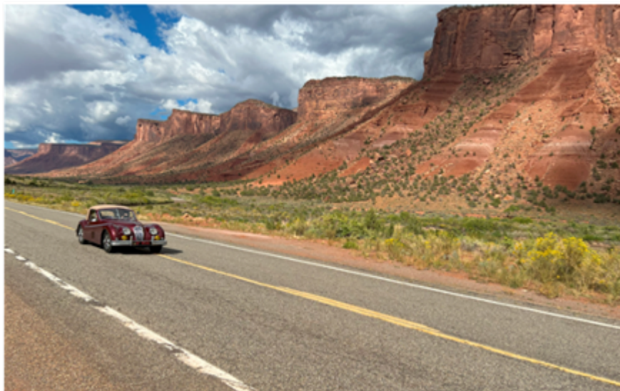
Gateway Canyon, Colorado mesas on route back to Telluride

From Telluride we headed up to Grand Junction then down Gateway Canyon. A magnificent, straight road; consequently, I was able to keep pace with a 2022 'Vette at 95 mph for 30 minutes.