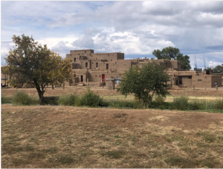
Taos Pueblo, New Mexico