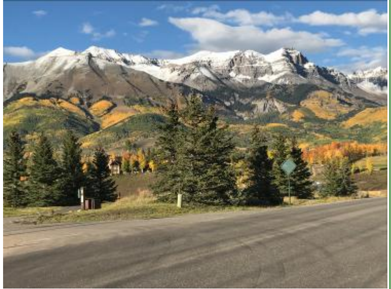
October snow cover in the Rocky Mountains, Colorado

I also discovered on Day 1 that additional electrical items were not working. In the high mountains, the heater stopped working, which was a big issue for my navigator. Also, the headlights and the horn did not work. That night, I found that the fuse for the heater was blown (after the rally I replaced the blower switch). I adjusted the working hi-beams to be the head lights (post-rally, I found the loose wire for the head lights). The horn was a thornier issue, resolved when I bent the tines on the steering wheel button back to where they can complete the circuit.