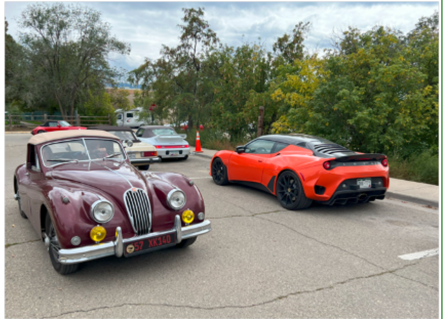
Ralliers at Dalton Ranch, Animas Valley, Colorado

But let me digress a minute. To insure I could keep up with the super cars, in 2020, I put in a 5-speed transmission or I should say attempted to put in a 5-speed transmission into the car. I bought the transmission through a web page covered in American flags; however, when I received the box it had "MADE IN MEXICO" written on the box in 70-point lettering! The first attempt at installing the transmission with the provided clutch plate did not offer enough room between the clutch and pressure plate to shift into any gears. I found this out after totally putting the car back together. By the way, for those who have not worked on a Jaguar of this vintage, the transmission and engine are supported together on the same mounts making the removal of the transmission a real challenge. So out came the 80-pound transmission.