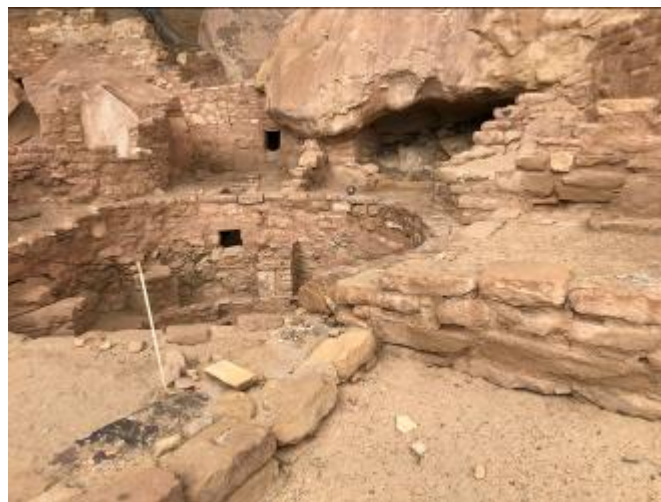
Step House kiva, Mesa Verde National Park