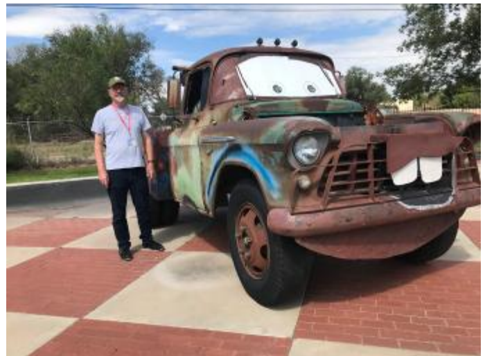
My next restoration project located in Colorado.

Claire completed the 1,400-mile rally with no additional issues, until the car was shipped back. Upon arrival, the fuel line from the pump was leaking. I did everything I could to stop the leak to no success. The problem was discovered when my employee put the nipped end of the fuel line in water and blew into the line...the soldered joint had failed. I used silver-based solder to successfully repair the leak.