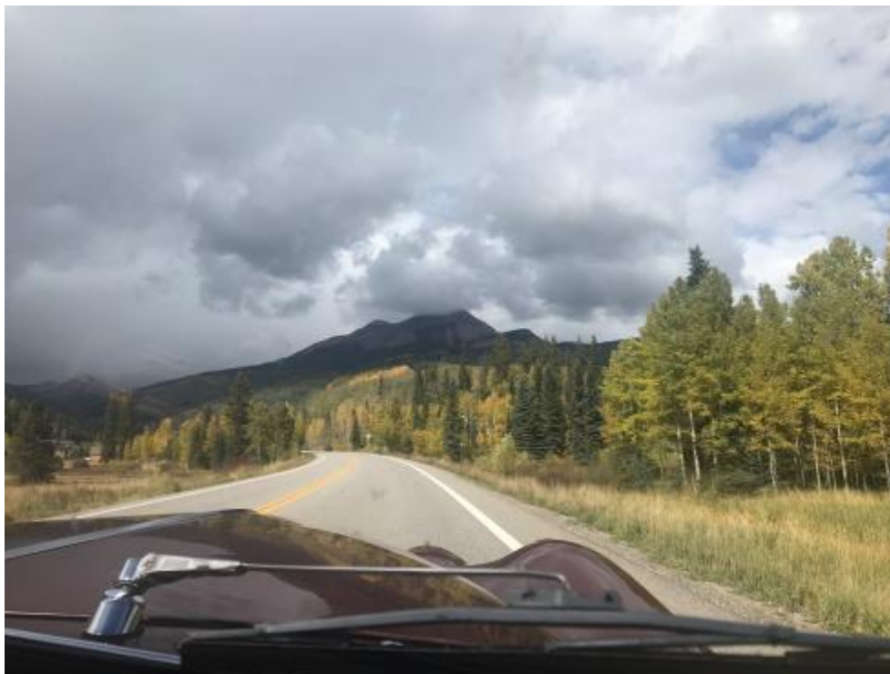
On the road to Valle Grande, New Mexico, note the rain.

Claire, however, impressed me by starting up every time, even at Telluride, elevation 9,500 feet above sea level, without any problems. However, when I started the rally in Santa Fe, I noticed the speedometer was not working. This had happened before and I think it is from having a speedometer internal cable that is a little too short to seat securely into the transmission (provided with the 5-speed transmission I installed).