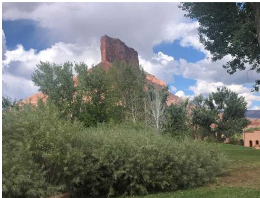
Dalton Ranch, Animas Valley, Colorado

After touring northern New Mexico, we head north, crossed over the Navaho Dam; and entered Colorado. Our first stop was Dalton Ranch, 10 miles north of Durango. Dalton Ranch is a retirement community based upon golf with a clubhouse with an exceptional car collection. The views at Dalton Ranch are spectacular.