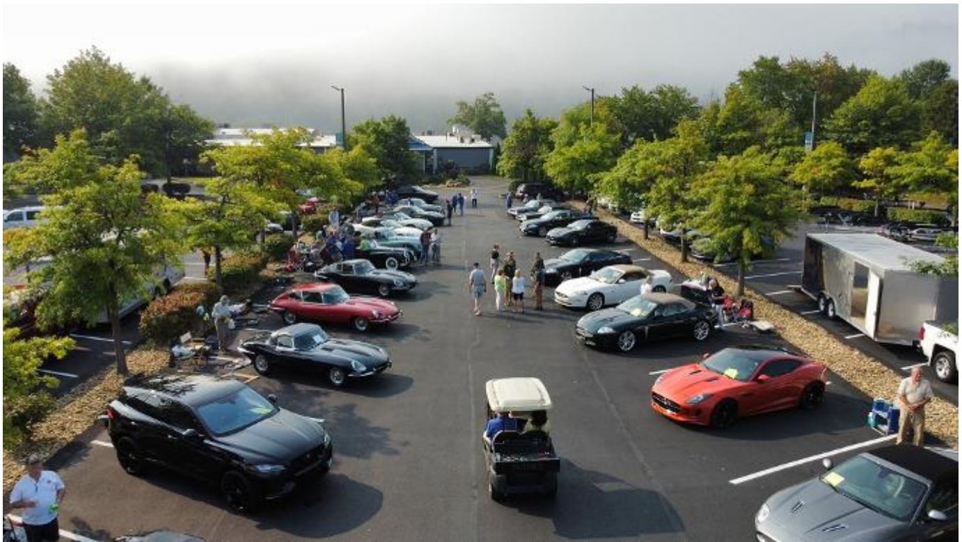
Cars lined up at the 2022 Pittsburgh Concours d'Elegance at Fox Chapel Yacht Club.