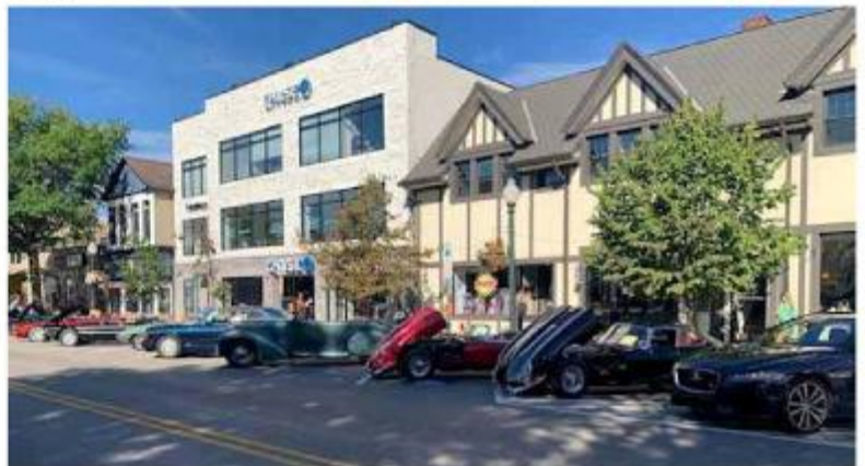
Pictures from 2022 Sewickley Show ^^^