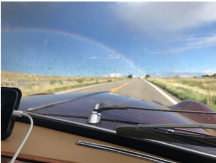
Final leg of the rally with a dirty windshield and rain.

Claire completed the 1,400-mile rally with no additional issues, until the car was shipped back. Upon arrival, the fuel line from the pump was leaking. I did everything I could to stop the leak to no success. The problem was discovered when my employee put the nipped end of the fuel line in water and blew into the line...the soldered joint had failed. I used silver-based solder to successfully repair the leak.