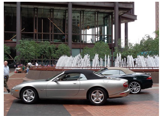
Chuck Pipich's and Tom Nuhfer's Jags on display in the Plaza.