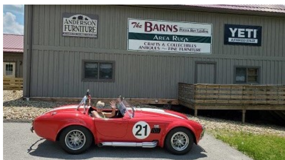
Left: The Barns at Potter Run Landing