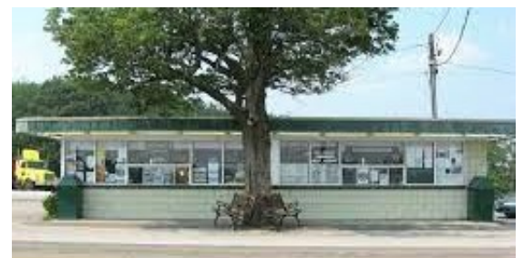
Above: Young's Custard Stand

Feel free to join in anywhere along the way, but be sure to RSVP for lunch. NOTE: This is a rain or shine event. If a summer shower, just bring the "other car". Your Jag will wait patiently for the next sunny day.