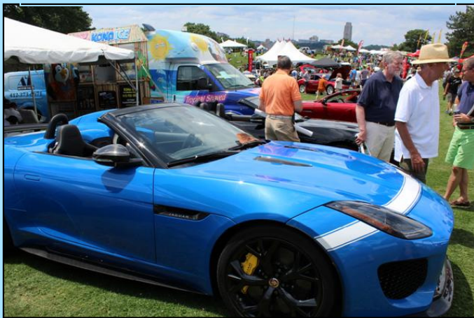
A&L Motors brought Jaguar's F-Type Project 7 in ultra blue to display at the PVGP.