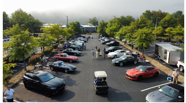
Cars lined up at the Concours d'Elegance at the Fox Chapel Yacht Club

The Jaguar Club of Pittsburgh will hold its 2023 Concours d'Elegance on Saturday, September 16 at the Fox Chapel Yacht Club, 1366 Old Freeport Road, Pittsburgh, PA 15238. Although due to unprecedented demand registration had to be closed early, you can still attend the show, talk with entrants, view the Jaguars and enjoy lunch at the Yacht Club's Baja Grill. (This year lunch will not be provided by JCOP.)