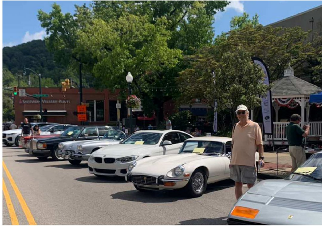
See Link below for MORE !