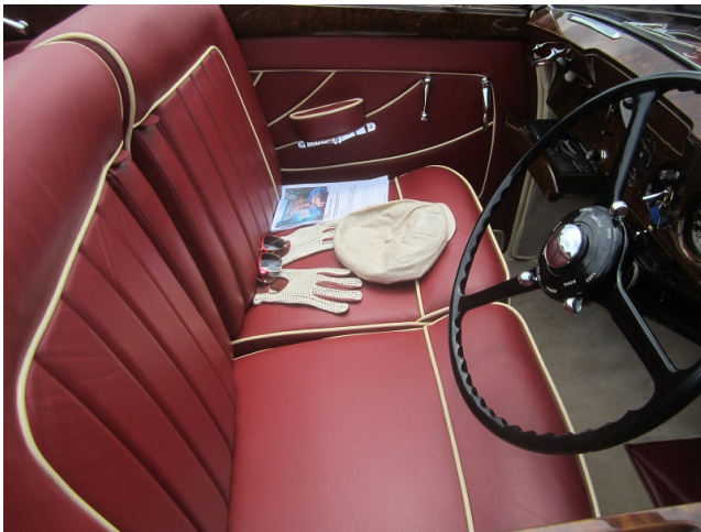
Gloves and hat ready for a tour of the countryside.

The show site, Ursuline College is a great venue for the Concours/European event. The expansive lawn had plenty of room for the 31 judged Jaguars, 16 display Jaguars and more than 130 European cars. One of my favorite cars on the European side, being a classic movie buff, was a 1954 Sunbeam Alpine Sports Roadster ( in the photo at left ), the model that starred in the Alfred Hitchcock movie “To Catch a Thief” along with Cary Grant and Grace Kelly.