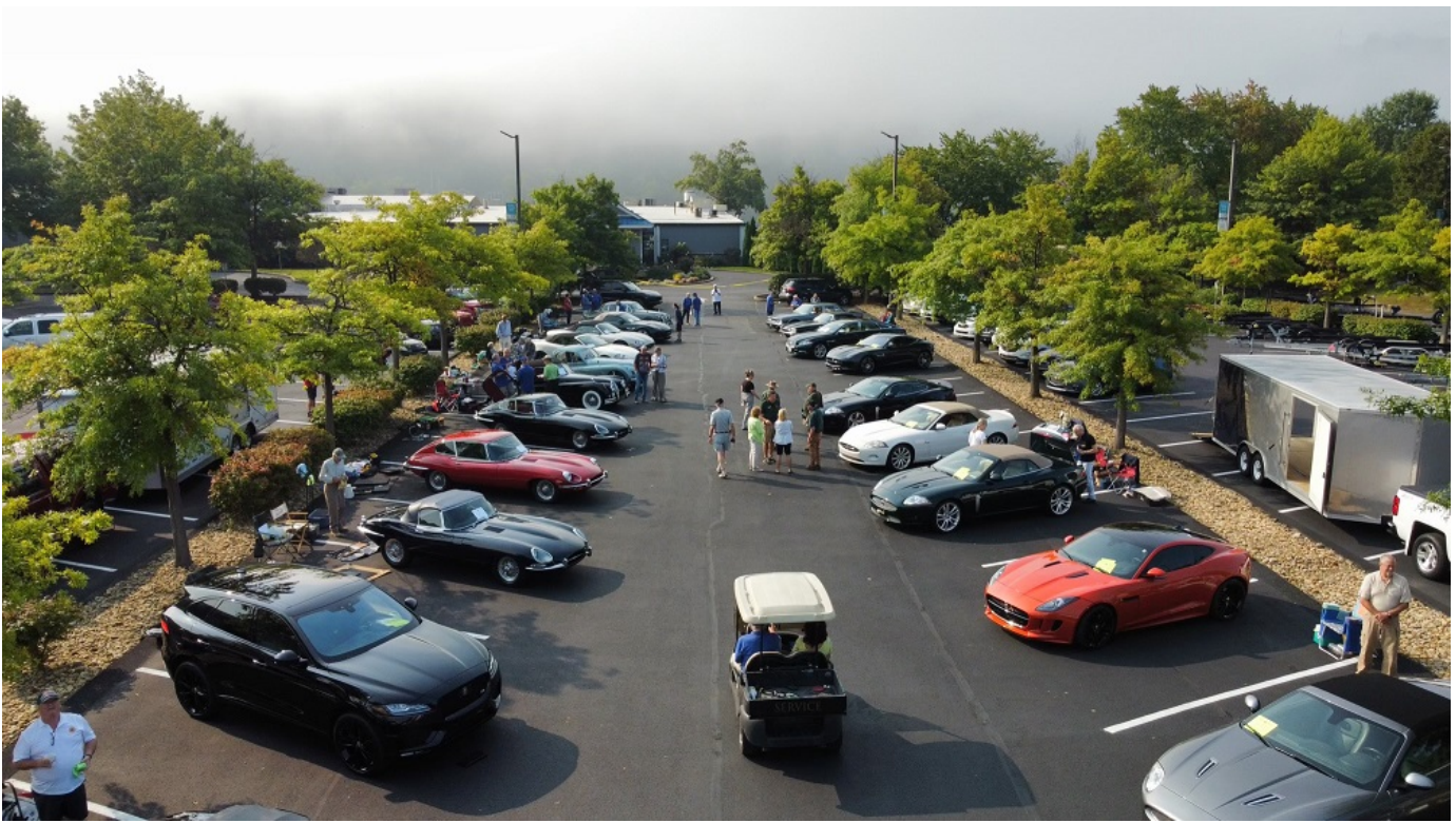
Cars lined up at the 2022 Pittsburgh Concours d'Elegance at Fox Chapel Yacht Club.