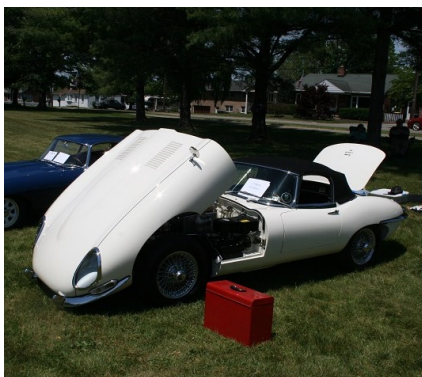
Lenny Fiore's 1965 E-Type.