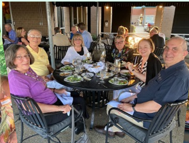
Jaguars at Jacksons

And Lots More Events! Hope to See You in 2025!