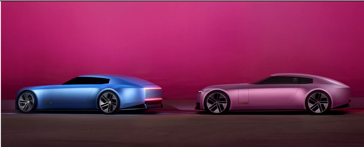
JAGUAR TYPE 00 Future. Vision.