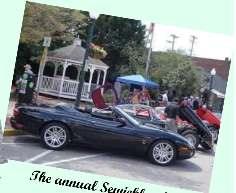
The annual Sewickley Show