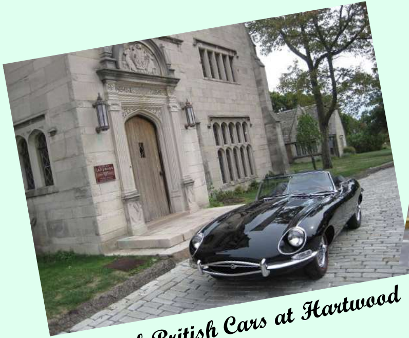
The return of British Cars at Hartwood