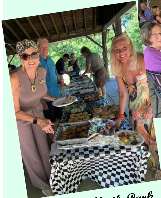
Our Picnic at North Park