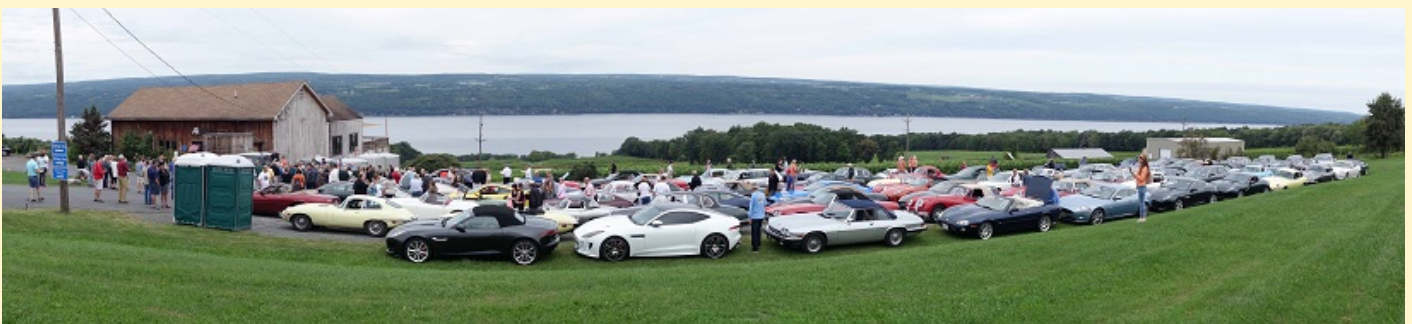
By Chuck Pipich (above & below)