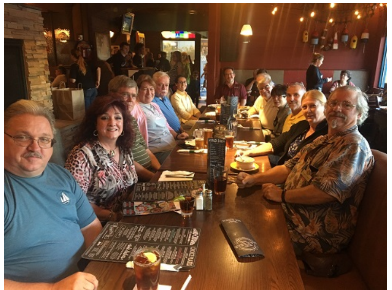
Out-of-towners got a warm welcome at an informal get-together after checking into the host hotel.