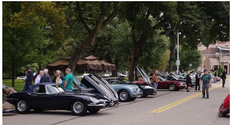
Above and Below: Brighton Road was filled with some beautiful and well-prepared Concours Jaguars.