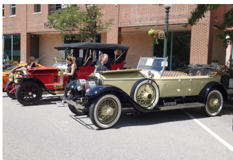
1912 and 1925 Rolls Royce Silver Ghost (The 1912 sets a new record this year)