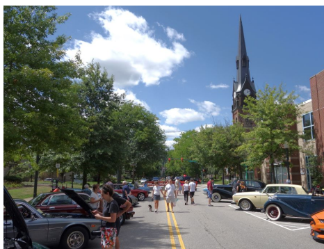
View of Broad St. with our Show in Progress